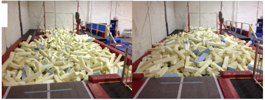
The pit before and after cleaning and fluffing up

We did hope to paint the new fire door, but as with all bank holidays, we were thwarted by the rain.