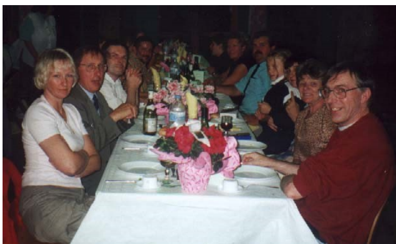
Civic Reception in Armentieres circa 2003