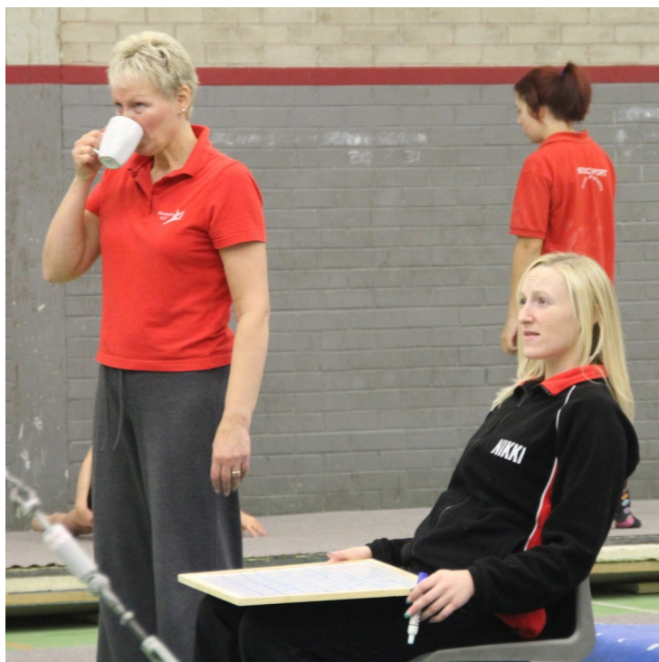
In the gym at Dialstone 2011