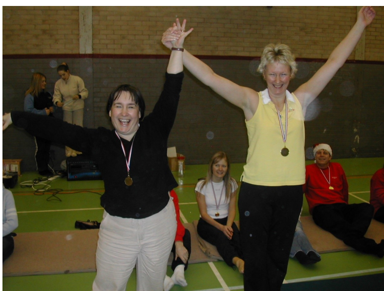
Parent's have a go day, a long time ago!