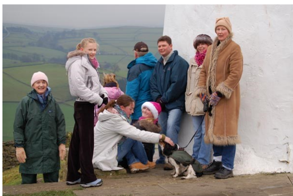
Well wrapped up (far right) for the Gym Christmas walk in 2006