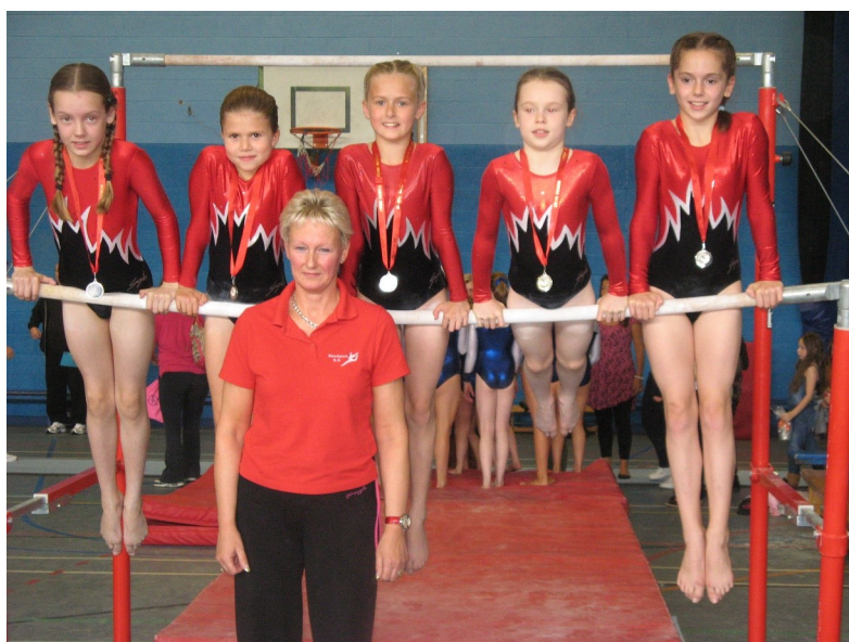
NW Teams Comp in 2010