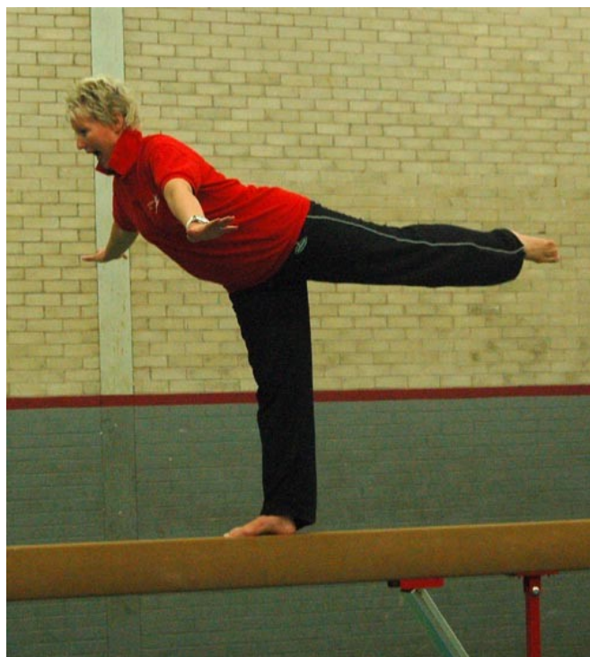
Parent's have a go day in 2007