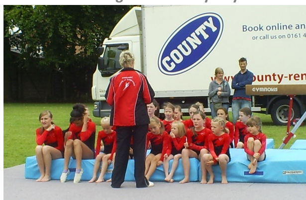
Organising a school display 2008