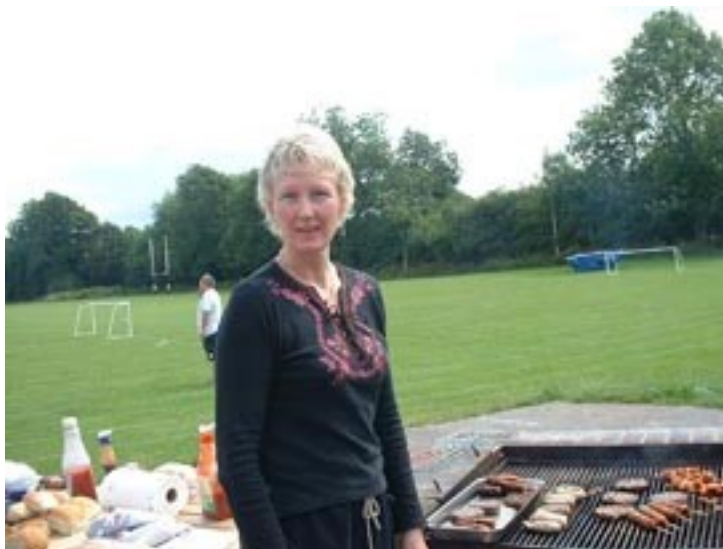
Gym Summer Barbeque