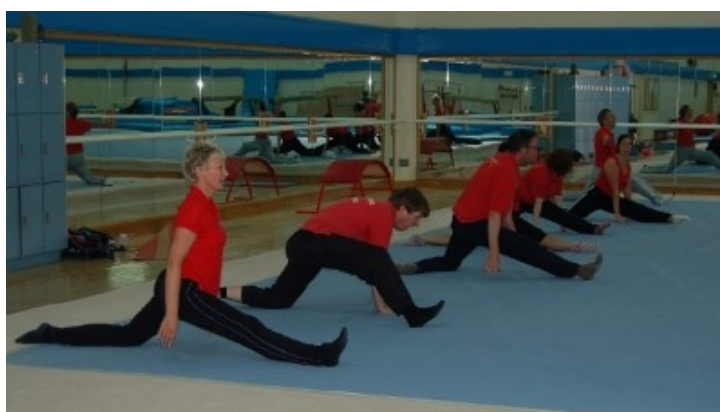
Splits at Lilleshall in 2010