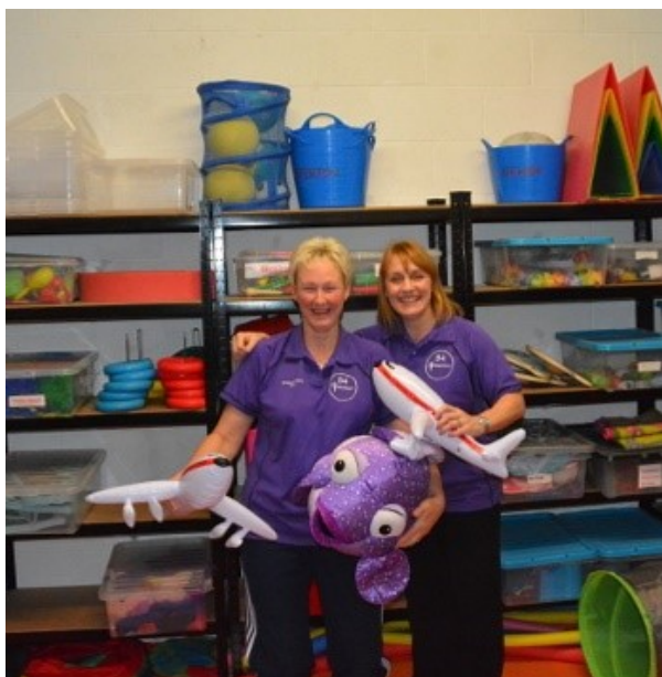
Pre-School Exams 2015