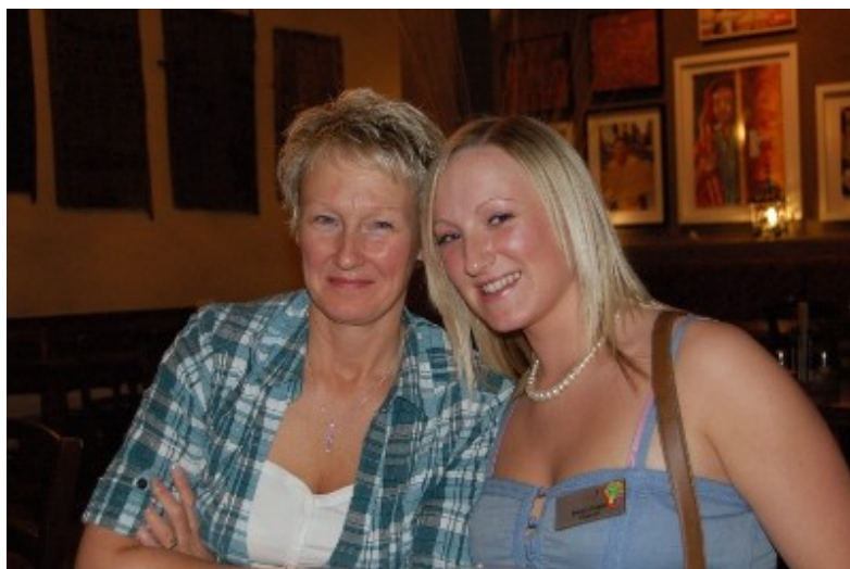
Gym Social in 2010