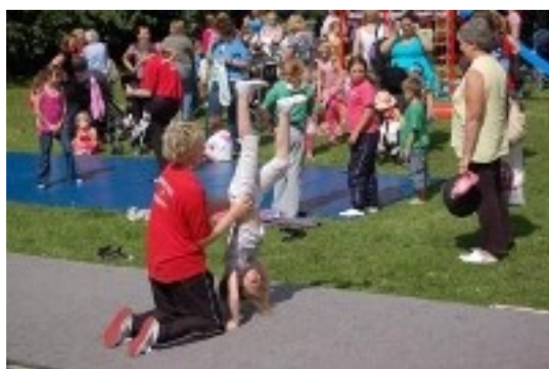
Torkington Park Play Day