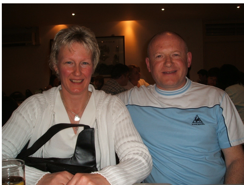
French Exchange Party in 2006