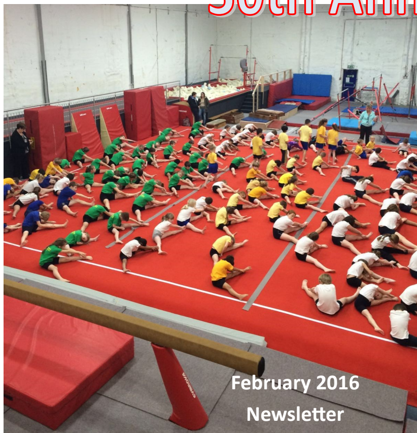
February 2016 Newsletter

January is a quiet month this year as there are no competitions, just training for the next events in February and April.